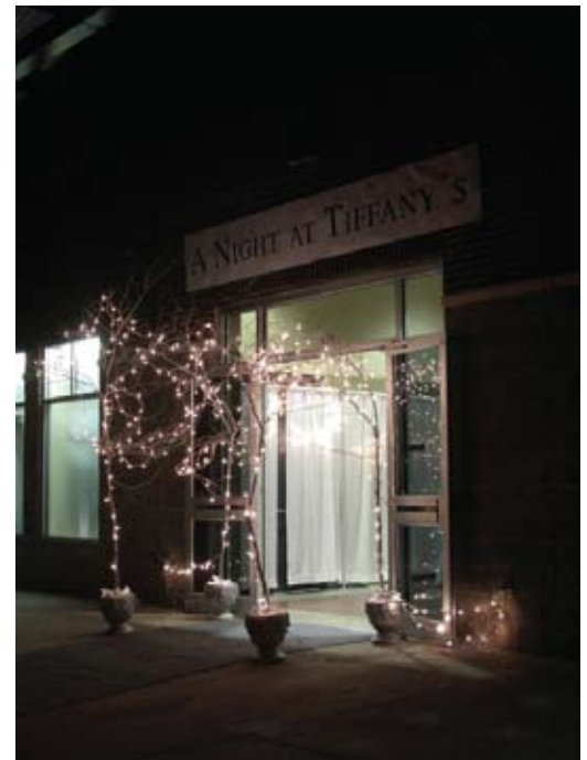
The Mississippi Farmers' Market was transformed for the Sub Deb Ball.