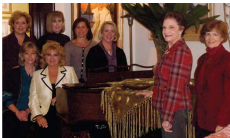
The 2009–10 Executive Committee of the Jackson Symphony League's Board of Directors includes: (back L–R)

None of this would be possible without YOUR generous gift of time in raising funds and supporting the work of this orchestra. We are most appreciative.